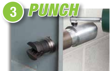
3 PUNCH Punch hole: Save time and money with every punch!