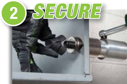
2 SECURE Secure SPEED LOCK onto draw stud: Faster setup and disassembly.