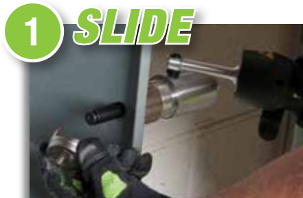
1 SLIDE Slide die and punch onto draw stud: “No-thread” design eliminates cross-threading.

“No-thread” punch design quickly and easily slides on/off draw stud: The fastest punch system on the market today.